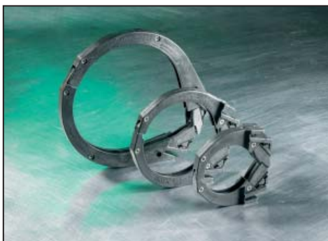
Three jaw sizes optimise the binding cycle for the different binding diameters.

Final assembly of the cable harnesses is much easier since the preassembled cable harness can be fixed to a panel edge or fixing hole. The tension of the tie is set individually as appropriate for prevailing application requirements.