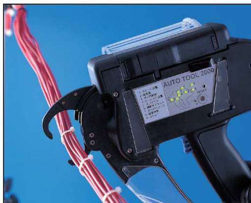
Cable ties can be attached and fastened in just seconds.

With the Autotool 2000 cable ties can be bundled, tightened and cut flush in a cycle lasting just 0.8 seconds. The maximum bundle diameter is 20 mm. Since the binding of the AT2000 can be adjusted to meet individual requirements, the tool is able to process both bands of 50 cable ties and reels with a capacity of 3500 ties.