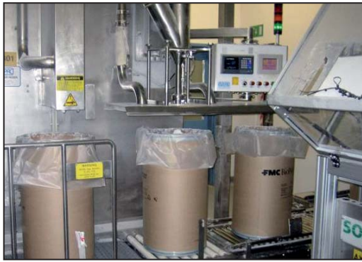
FMC uses a system developed by Somex Automation to fill and close its bags.

Somex equipment provides the customer, whose core area of activity is the beverages industry, with a solution which combines efficient production with high product quality.