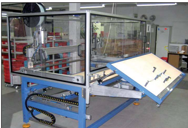
Changeover table consisting of a table structure and the automatic binding system.

Fresenius Medical Care chose a system by an Italian manufacturer of special purpose machinery which had been building what are known as changeover tables for Italian companies working in the assembly sector for a number of years. The changeover tables for cable assembly consist of a table structure with a freely programmable automatic binding system. The harness boards are located one above the other. A cable harness is laid out on alternate boards whilst a second board is tied automatically. Then the tied cable harness is removed and the one just laid out is inserted. There is no longer any additional time required for bundling.