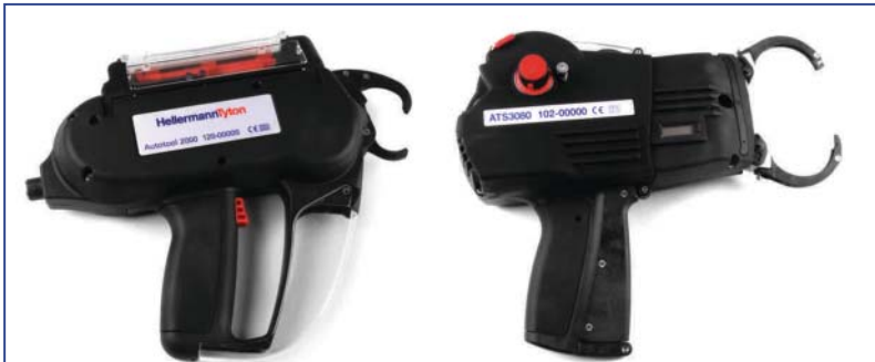
The AT2000 and ATS3080 automatic bundling systems.

HellermannTyton leads the market for automated cable assembly. Working in close collaboration with industrial customers, the company developed and optimised the Autotool 2000 (AT2000) and Autotool System 3080 (ATS3080) automatic bundling systems which are used today in numerous sectors of industry.