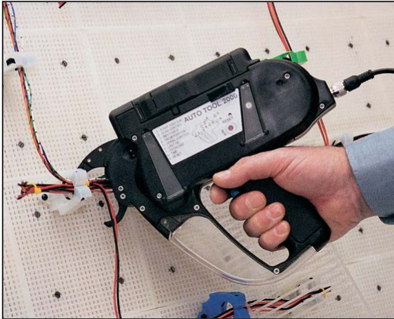
Manual production of a cable harness with the AT2000.

Fastening elements known as “bundling clips” can also be attached fully automatically. With a cable tie on the left and right the clips can be mounted quickly and will not move once attached to the item being tied.