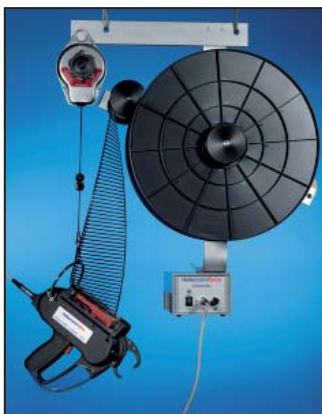
AT2000 with overhead dispenser for mobile application.