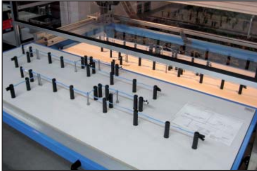
Harness board with a Fresenius cable harness.

Calculated for the complete cable harness, binding takes an average of 2 seconds, including the distance travelled. Fresenius manufactures many different products, although the majority are small types of cable harnesses. To make the most efficient use of the boards for laying out the cables, two harnesses are often laid out one next to the other on a single board.