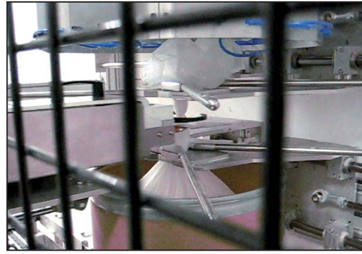
Horizontal application of the ATS3080.

The plastic bags are placed inside large containers and move from station to station along a conveyor belt. Once the bags have been filled, the container is forwarded to the closing station. At the sealing station, the plastic towards the top of the bag is gathered together by two V-shaped slide bars to a diameter of approximately 50 mm. The ATS3080 is a permanently integrated component of the fully automated system. Since the area in which the entire process is completed is potentially fire hazardous, the system has been encapsulated to provide protection against the high levels of fine dust prevailing in the atmosphere. Once binding is initiated by the equipment's start signal, the horizontal dispenser on which the ATS3080 is mounted moves towards the plastic bag. The operation to close the bag with a cable tie is fully automatic and takes approximately 1.3 seconds. Unlike its standard market equivalent, the cable tie is made from a continuous strap and separate closures - as a result, the binding process is entirely waste-free.