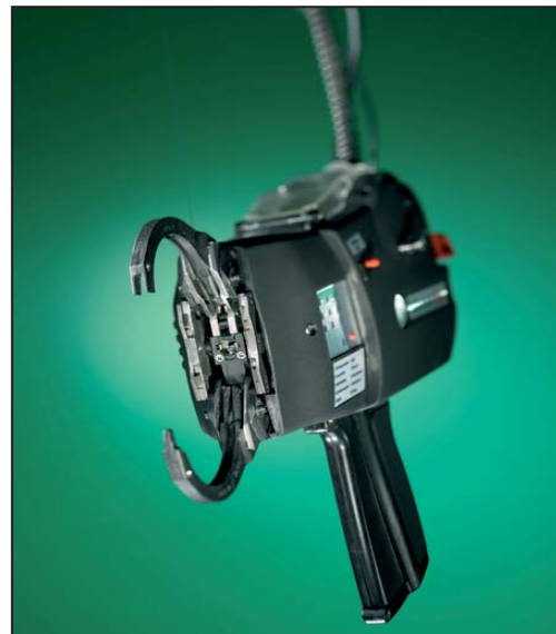
The Autotool 3080 system.

The AT3080 is the ideal choice for maximum application flexibility. There is no alternative to this system available on the market. The device can be supplied with quick-replace binding jaws measuring 30, 50 and 80 mm, facilitating the fully automatic bundling of diameters from 1 mm to 80 mm. Bundling speeds range from 0.8 to 1.6 seconds per cycle dependent upon bundle diameter. A two-part closing system comprising an outside serrated strap on a continuous reel and separate closures means that absolutely no waste is produced by the binding process. Furthermore, the AT3080 is able to bind a large number of clips fully automatically.