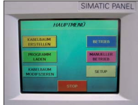
A user-friendly system.

It was possible to meet all of the aims listed above by converting the manual production process to this handling system. Throughput times were reduced with the error quota of 0.7 min/cable harness remaining constant. As a result, Fresenius was able to achieve a significant reduction in manufacturing costs of approximately 20%. Furthermore, automation provided Fresenius Medical Care with a means of considerably increasing safety and user-friendliness for its operators. The height-adjustable nature of the tables, the inclined position of the boards for laying out the harnesses and minimum noise emissions mean that the workplace is now much more ergonomic than before.